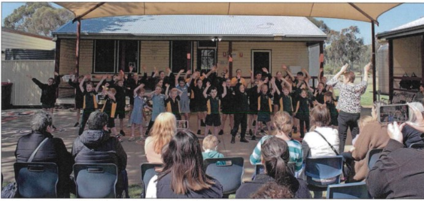
For their open day, all of the Bunnaloo Public School students sang Coming Home by Sheppard, complete with dancing.