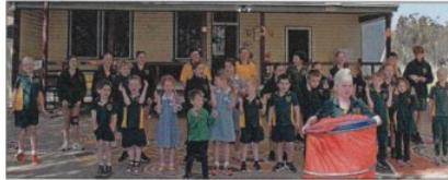
The whole school combined again to sing and dance to Herman the Worm .

Each class presented a musical item for visitors, as well as two whole-school performances, Coming Home